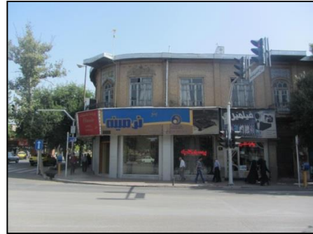
Fig 6. Eastern side of Sabzeh Meydan