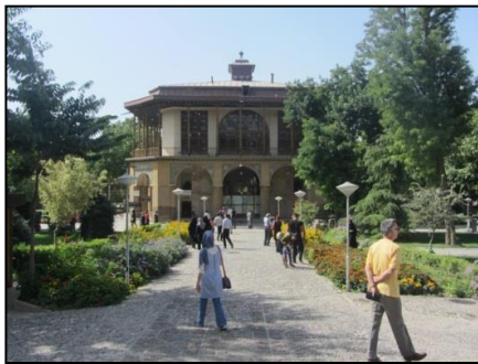
Fig 3. Southern side of Sabzeh Medan