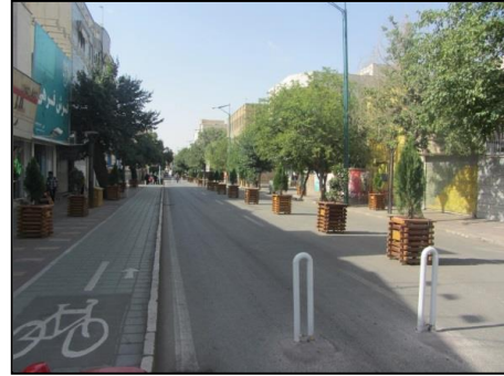
Fig 11. Southern vision of Khayam