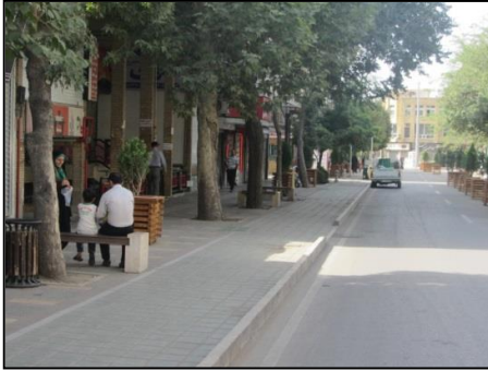
Fig 10. Eastern side of Khayam

Khayam Street has been garden alley in the past but currently it is considered as commercial axis in the city. Its southern part is used as a sidewalk. Different types of shops including clothing, bags and shoes, decorative furniture, jewelry, and so on are located alongside this path; the shops which are gradually getting newer designs and a become a modern place in public's mind.