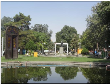
Fig 2. Centerai area of Sabzeh Meydan

Sabze Meydan (Azadi) Square is the main square in Qazvin. In northern side of the square there are shops and banks, in eastern and western sides, shops are located while in southern part there is Chehelsotoun (Kolah Ferangi) building, Safavid era palace and its surrounding buildings. One of the importance factors for this building is being located in historical and cultural area of the city and being as a place to pass leisure time.