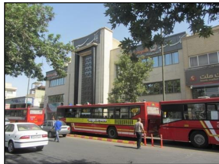
Fig 4. Northern side of Sabzeh Meydan