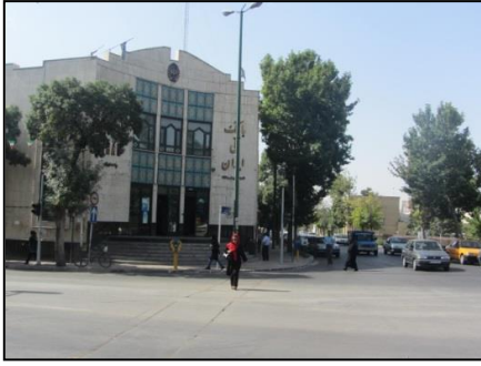
Fig 5. Southeast side of Sabzeh Meydan