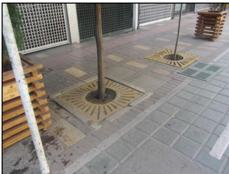
Fig 12. Details