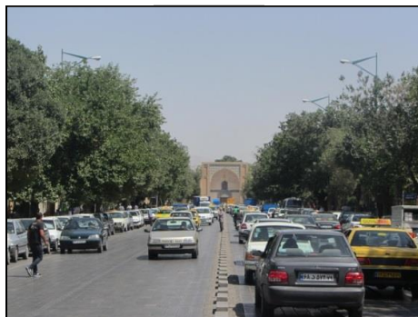
Fig 9. Northern vision of Sepah Street