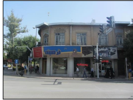
Fig 6. Eastern side of Sabzeh Meydan