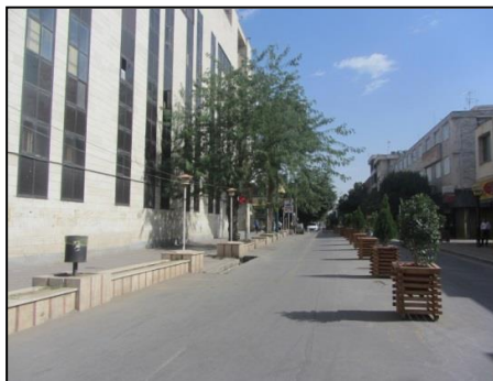
Fig 14. Northern vision of Khayam