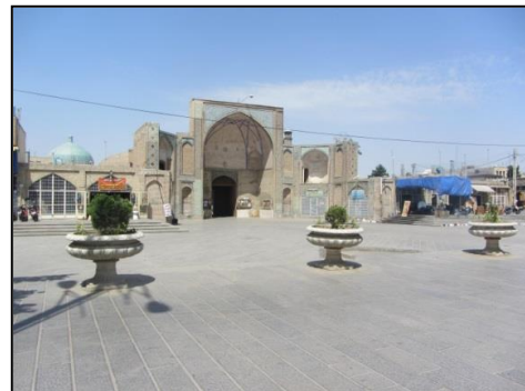
Fig 8. Western side of Sepah Street