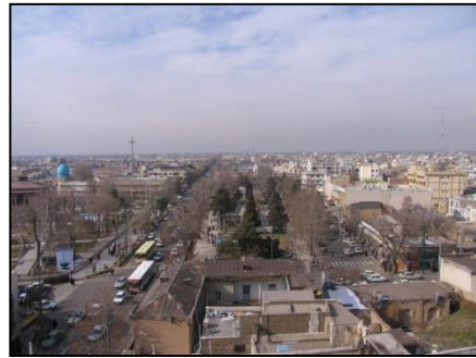
Fig 1. Sabzeh Meydan