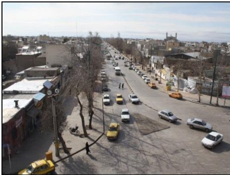
Fig 7. Northern side of Sepah Street

Sepah Street is the first street in Iran which has been constructed in Safavid era when Qazvin was the capital of Iran. This road starts from Alighapou façade and ends to Jame Mosque and its evolved plan could be observed in Chahrbagh after capital shift to Isfahan. In Shah Safi era, the street was continued from southern side to the cemetery of the city. At first, it was named Dolati Street and in Pahlavi Era it was called Sepah while currently has been recognized as Shohada Street. There has been variety of usage for this street including residential usage, bazar and commercial malls, Jame Mosque, cistern, and so on.