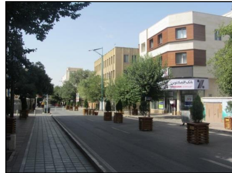
Fig 13. Western side of Khayam