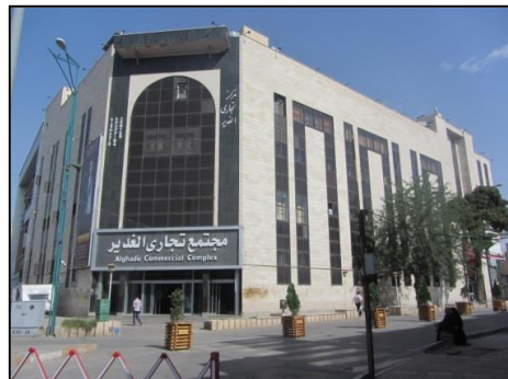
Fig 15. Southern side of Khayam