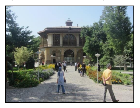
Fig 3. Southern side of Sabzeh Medan