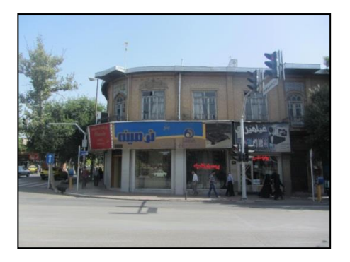
Fig 6. Eastern side of Sabzeh Meydan