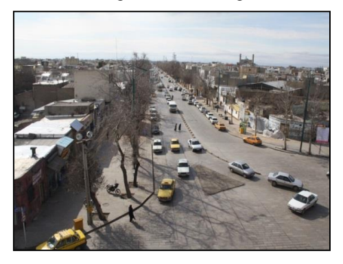
Fig 7. Northern side of Sepah Street

Sepah Street is the first street in Iran which has been constructed in Safavid era when Qazvin was the capital of Iran. This road starts from Alighapou façade and ends to Jame Mosque and its evolved plan could be observed in Chahrbagh after capital shift to Isfahan. In Shah Safi era, the street was continued from southern side to the cemetery of the city. At first, it was named Dolati Street and in Pahlavi Era it was called Sepah while currently has been recognized as Shohada Street. There has been variety of usage for this street including residential usage, bazar and commercial malls, Jame Mosque, cistern, and so on.