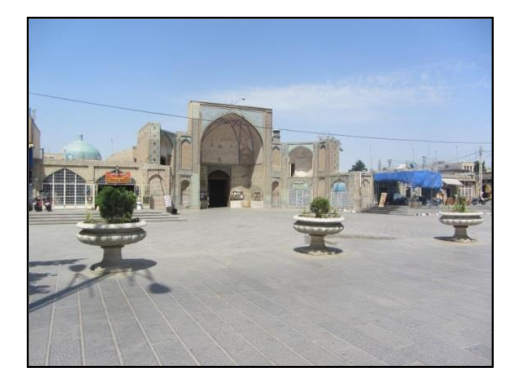
Fig 8. Western side of Sepah Street