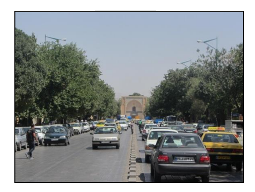
Fig 9. Northern vision of Sepah Street