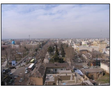
Fig 1. Sabzeh Meydan