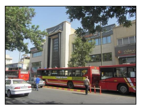
Fig 4. Northern side of Sabzeh Meydan